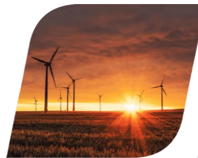
Energy & Electronics